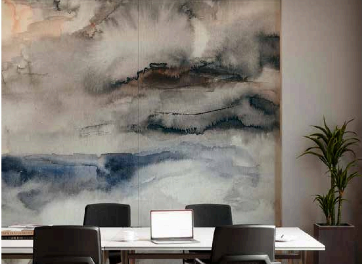
Smoke in the Bay