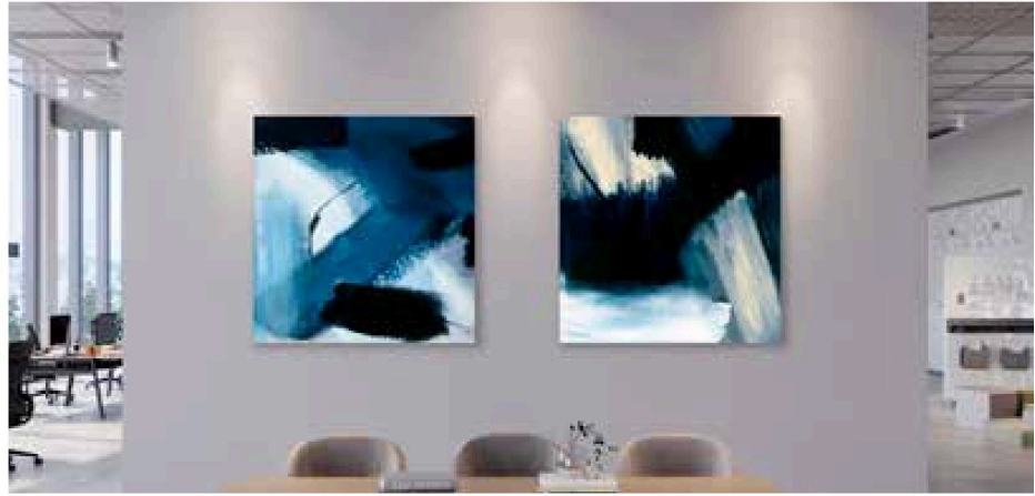
Artwork - "Endlessness" by Donna Solovei 2 Section Composition of 43"W x 43"H x 2"D Panels