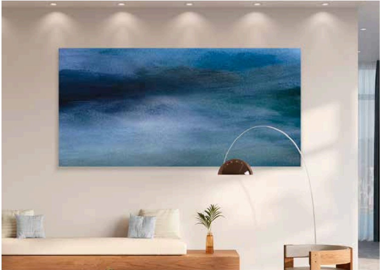
Artwork - "High Tide" by Donna Solovei 90"W x 43"H x 2"D Panel