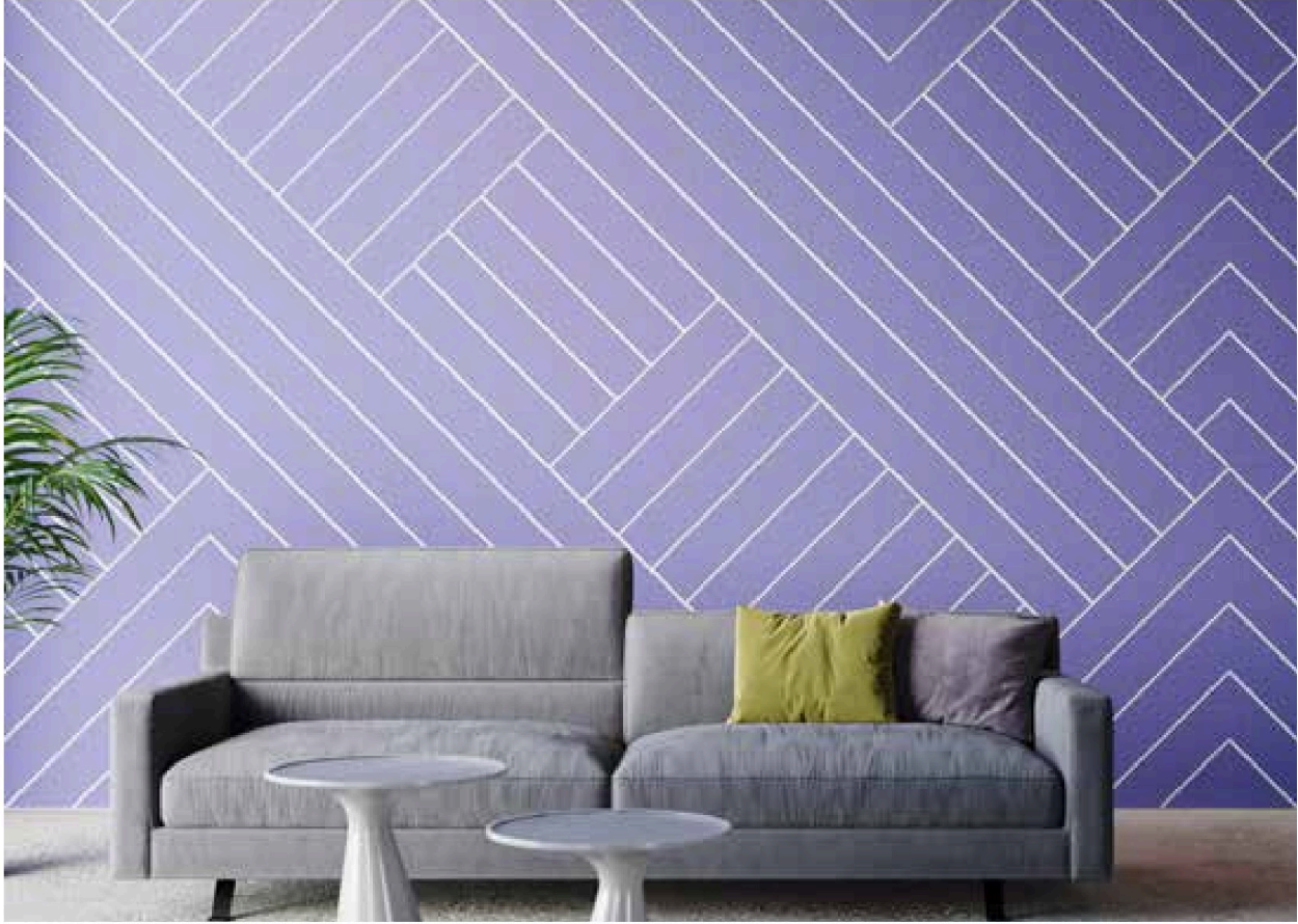
Pattern: SLANTED Base Color: CLASSIC WHITE CW04 Surface Color: DAWN 2-552