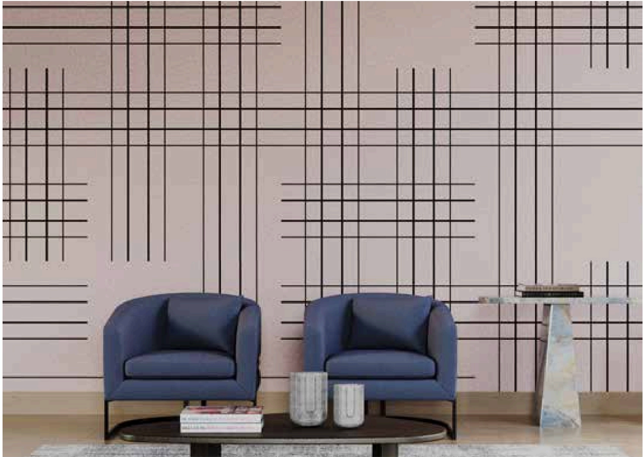
Pattern: SCOTCH Base Color: MIDNIGHT NAVY MN12 Surface Color: FLINT 2-408ML