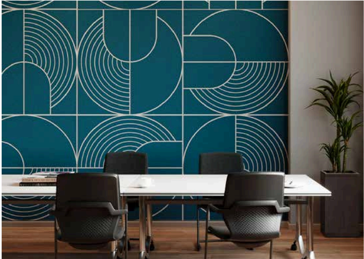
Pattern: DISCO Base Color: LIGHT BEIGE LB01 Surface Color: SPRUCE 2-562ML