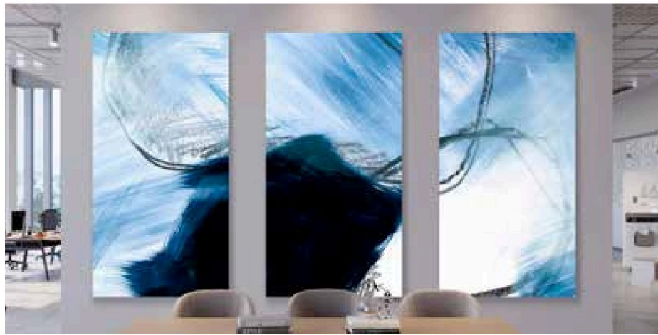
Artwork - "Deep Blue" by Donna Solovei 3 Section Composition of 43"W x 90"H x 2"D Panels