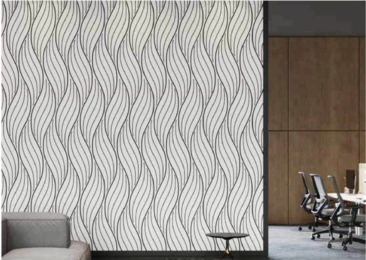
Pattern: CURL Base Color: EBONY SLATE ES07 Surface Color: PORCELAIN 2-400